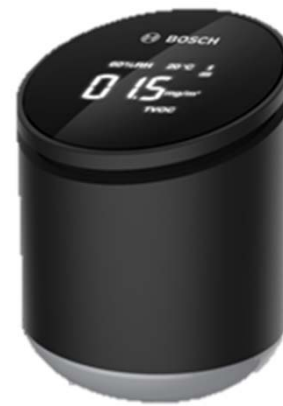
Bosch Air Quality Sensor