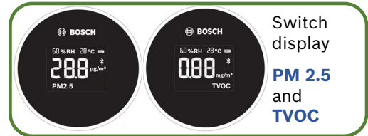
Switch display PM 2.5 and TVOC